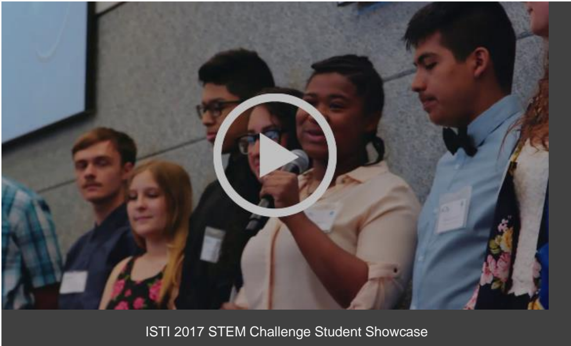
ISTI 2017 STEM Challenge Student Showcase